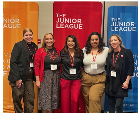
Advocacy & Leadership Institute November 8-10, 2024 Chicago, Illinois