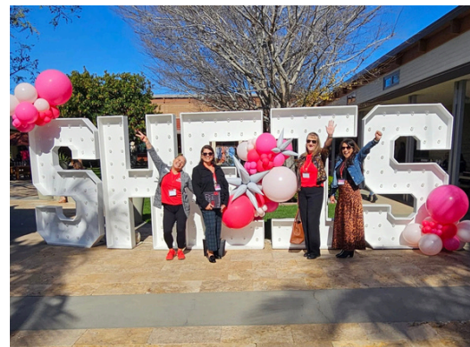
She Is Conference March 8, 2025 Orange County, California