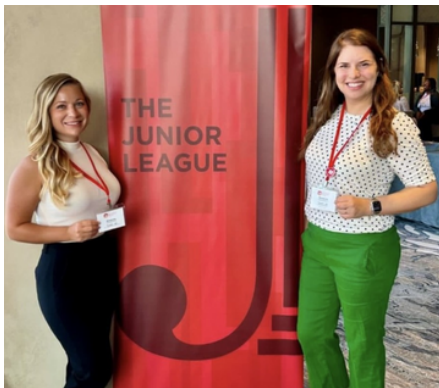
Organizational Development Training August 15-18, 2024 Norfolk, Virginia

In 2024-25, the Nominating Committee invested in the leadership development of JLT members by sending 12 women to conferences all across the US (see photos below). The Nominating Committee also successfully interviewed and slated a full Board of Directors for the 2025-26 league year. Members of the Nominating Committee increased the inclusivity and accessibility of JLT's leadership development by updating its interview process and providing a clearer per diem for travel expenses.