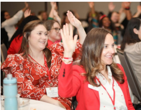
Executive Leadership Training February 21-23, 2025 San Diego, California